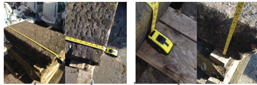
reclaimed coping stones

Extension to existing wall to create paved connection to Metrolink footpath Coping Stones available from Canal & Rivers Trust Facing stones to be chiselled yorkstone